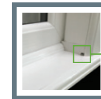
□ Drainage Channel