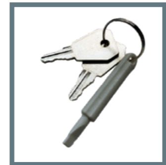
Use key supplied To lock or unlock Cam Lock