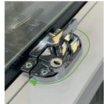
Closing/Locking Rotate arm to lock window (CLOSED POSITION). Insert keys and lock (if required).