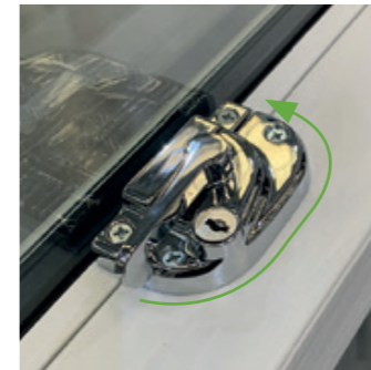
Opening Remove keys when unlocked and rotate arm to unlock window (OPEN POSITION).