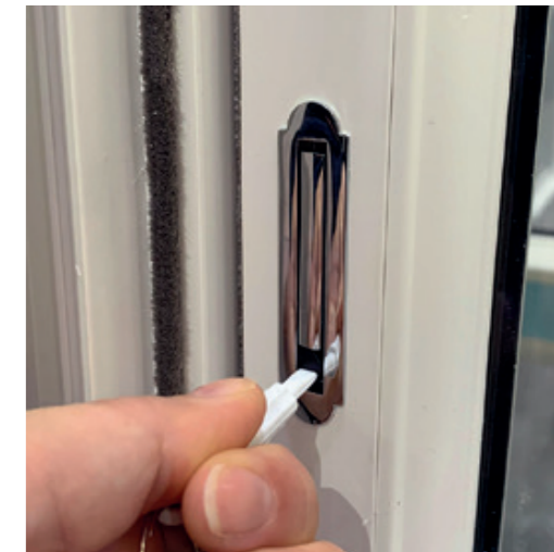
Fit key into cam and turn clockwise to open restrictor