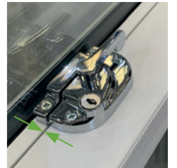
IMPORTANT Please ensure that the keep and cam lock are parallel with each other before engaging the arm into the closed position.